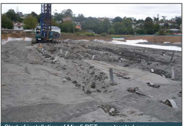
Start of installation of Mirafi PET over treated area