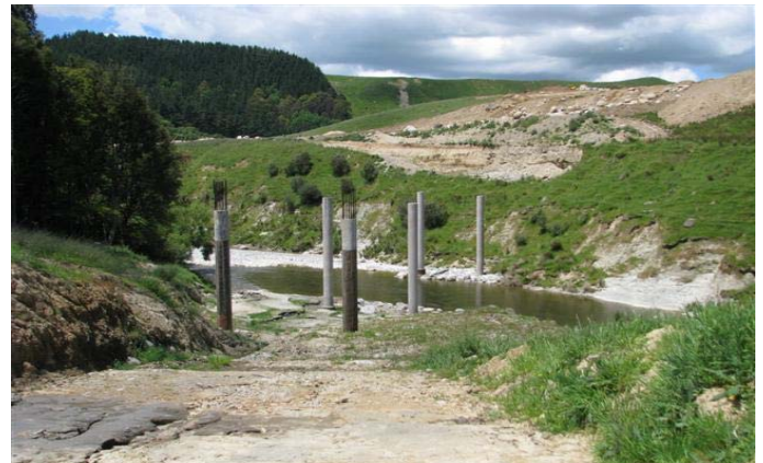
Bridge prior to construction with piers installed Date: Feb 2009

The contractor completed the structure for the Southern Abutment (330m 2 ) and for the Northern Abutment (600m 2 ) expediently and was very pleased with the final outcome.