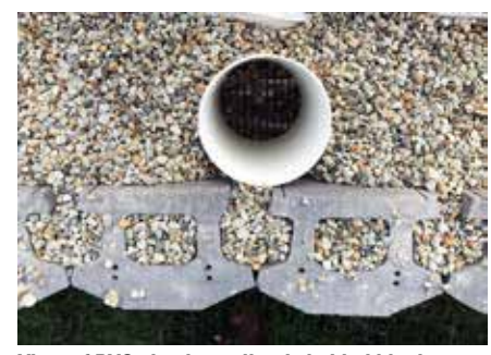
View of PVC pipe immediately behind block facing to house outer guard rail