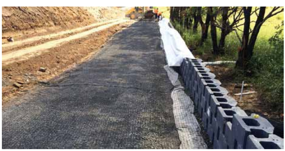
Construction of the reinforced segmental block wall using Miragrid® 8XT geogrid reinforcement cut to design length