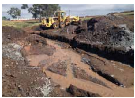
Soft soil conditions through culvert area

AS4678:2002 Earth-Retaining Structures, Standards Australia.