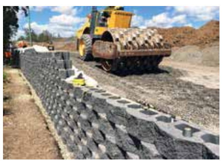
Compacting the granular reinforced fill behind the segmental block wall