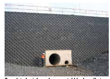
Completed reinforced segmental block wall at culvert location