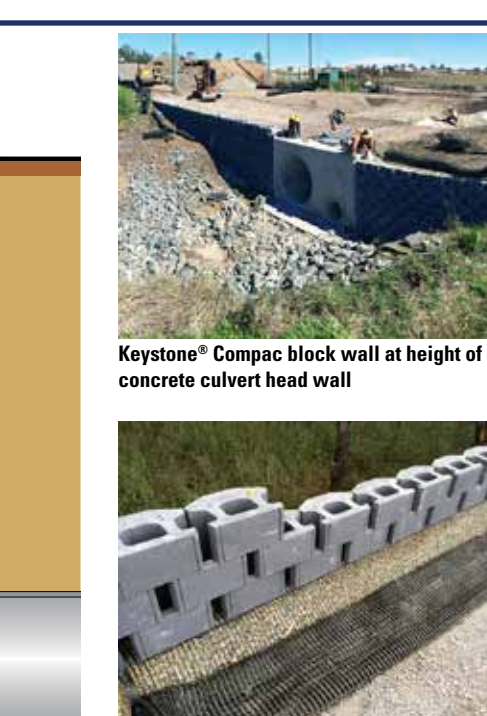
Reinforced segmental block wall showing Keystone® Compac block, Miragrid® 8XT geogrid and drainage layer components

BS8006:2010 Code of practice for strengthened/reinforced soils and other fills, British Standards Institution.