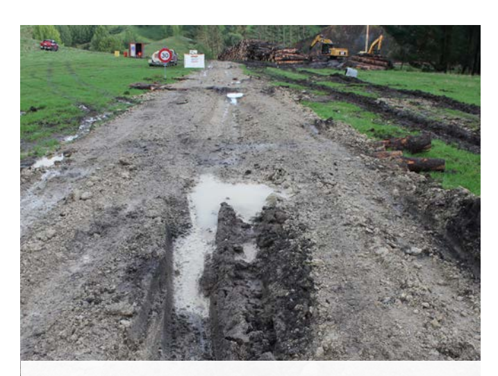
FORESTRY ROADING APPLICATION Road prior to Mirafi RS380i installation

Since the installation on this site the Mirafi RS380i has also been used on another site using up to 300mm aggregate, and no issues were encountered. This is likely to be used on other difficult sites that are hard to enter during winter, especially on private blocks to be harvested where the roading network has to be established from nothing, and can use the cheaper larger straight haul aggregate.