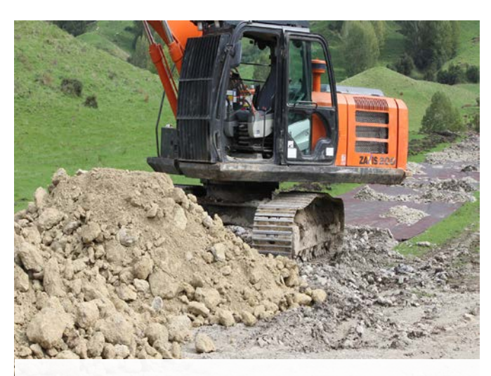
FORESTRY ROADING APPLICATION Limestone aggregate ready to spread