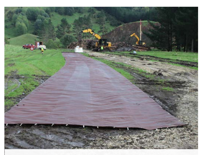
FORESTRY ROADING APPLICATION Start of Mirafi RS380i Installation