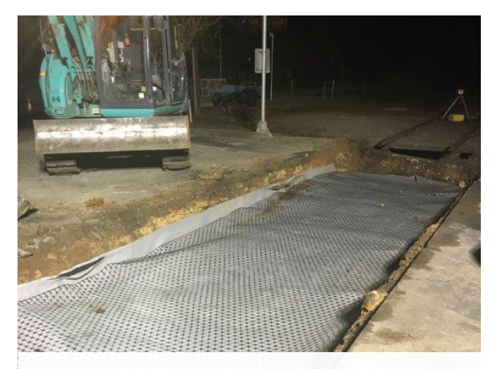
PLACEMENT OF GEOSYNTHETICS Tracktex and Tensar TriAx 190L rolled out onto the clay subgrade