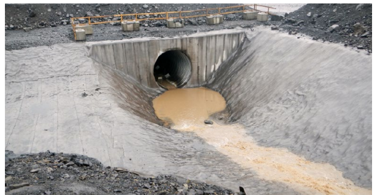
Figure 4. Typical Type III GCCM channel lining application over loose subgrade.