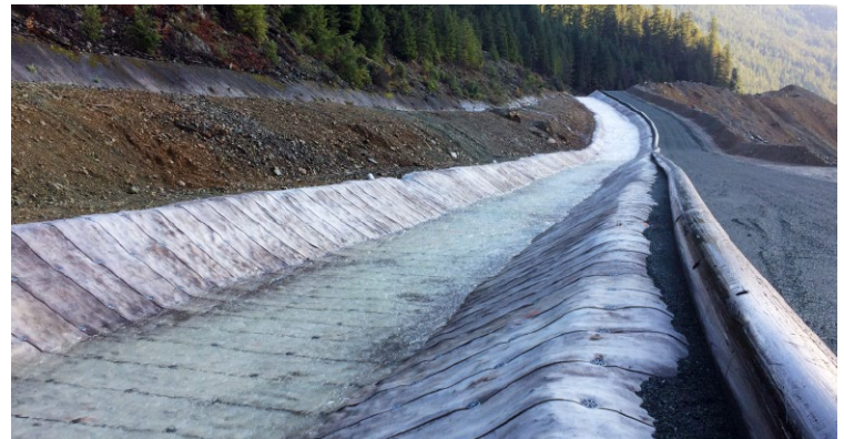
Figure 3. Typical Type II GCCM channel lining application.