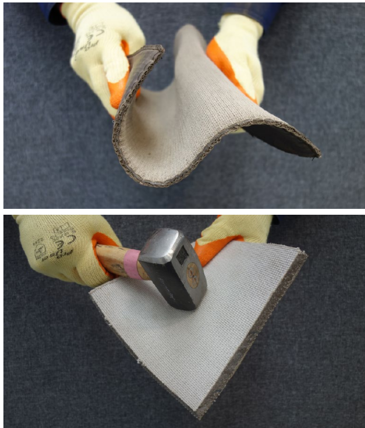
Figure 1. The change of GCCM properties from flexible to rigid on curing means that when assessing GCCM properties, appropriate test methods should be used to determine the cured, in-service GCCM cementitious layer performance.

GCCMs are the only geosynthetic to contain unset cementitious material and pre-existing geosynthetic test standards do not include methods for understanding the performance of the cementitious material contained within a GCCM. It is therefore important to test the properties of the cured cementitious material so that the behaviour of the GCCM as a hardened composite can be understood. It is also critical to ensure the cementitious material is cured at a water/powder ratio that is representative of field (in-service) hydration and not artificially controlled in the laboratory.