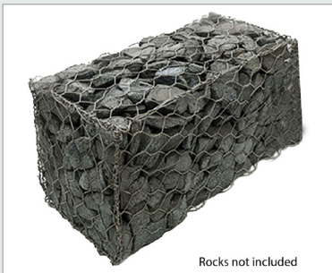
Rocks not included