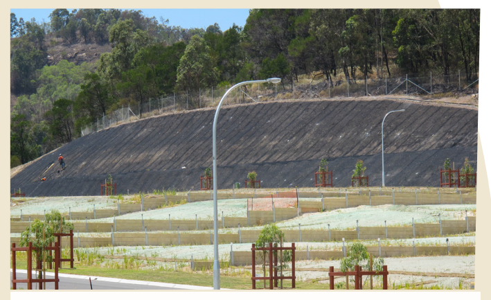
The slope after installation of MacMat® R prior to hydroseeding.

Maccaferri MacMat® R was specified for the lower batter where an increased tensile strength and punch resistance was required to support potentially loose soil and rock. Maccaferri MacMat® R is a three-dimensional, permanent geomat that provides surface reinforcement, stops erosion and promotes revegetation. An integral woven steel mesh reinforces the geomat, significantly increasing its tensile strength (up to 54kN/m) and punch resistance (up to 67kN), enhancing its erosion protection ability and shear resistance capacity when compared to unreinforced erosion protection mats.