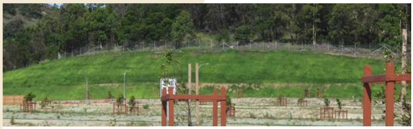
Six weeks after the MacMat R was installed - extensive vegetation establishment after hydroseeding.

MacMat<sup>®</sup> R can be also be supplied using green or brown polymer fibres.