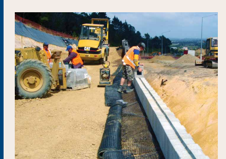
Reinforcing with Miragrid® GX geogrids.

Installation of the block wall facing, geosynthetics and the soil backfill are all in one construction process. Thus, the construction is relatively fast without the need for special lifting equipment and highly skilled labour. Reinforced segmental block walls have become an accepted practice for a fast, durable, aesthetic and cost effective retaining wall. The system is suitable for applications ranging from landscape terraces, housing developments to major structural walls.