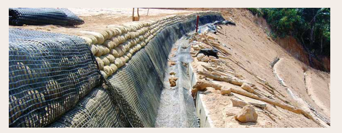
Miragrid<sup>®</sup> GX geogrids being wrapped around stacked geobags to contruct a wall.

This facing system is suitable for slopes with angles up to 80° and heights varying from 3m to 50m. Ground water seepage is controlled by installing a geosynthetic wrapped stone drainage layer at the rear of the reinforced soil structure with the ground water discharged through drainage pipes into surface drains. The completed structure, when vegetated, blends easily with the surrounding environment. It is a proven and cost effective alternative to conventional concrete structures.