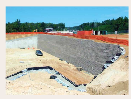
Segmental block wall nearing completion.