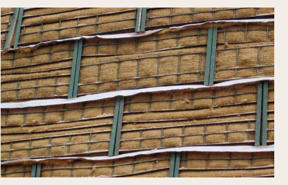
Front of a steep slope with steel mesh formwork facing nearing completion.