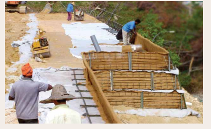
Steel mesh formwork being set-up above layers of Polyfelt® PEC geotextiles.

TenCate Polyfelt® PEC is most commonly used as the reinforcement when the soil mass consists of finer-grained backfill that has poor drainage properties. Alternatively, TenCate Miragrid<sup>®</sup> GX geogrid is typically used to reinforce coarser-grained soil backfills. This system is ideal for slopes with angles up to 80° and heights ranging from 2m to 25m. It provides a stable facing that blends with the surrounding landscape.