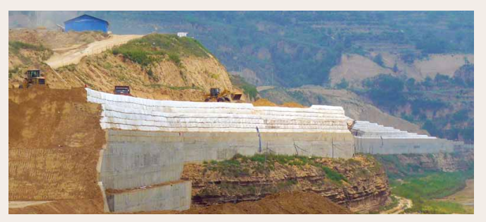
Reinforced soil wall during construction.