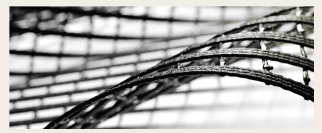
TenCate Miragrid® GX.

Both Miragrid<sup>®</sup> GX and Polyfelt<sup>®</sup> PEC are quick and easy to install and work effectively with various types of facing systems. Practical green-facing systems can also be easily adopted to blend in with the surrounding environment.