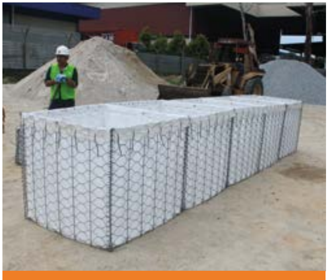
FlexMac® DT unit ready for filling

FlexMac° DT can be a temporary or a permanent solution. When used as a permanent solution after the emergency has passed, FlexMac° DT can be covered and re-vegetated in harmony with the environment.