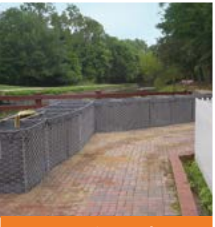
Deployment of FlexMac<sup>®</sup> DT