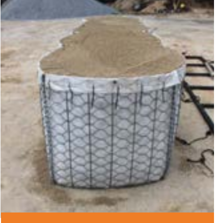
FlexMac<sup>®</sup> DT with fill material